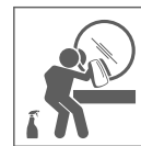
Spray and Wipe

Apply sparingly and wipe off with a clean lint free cloth.