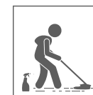
Spray and Mop