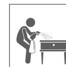
Spray and Wipe