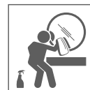
Spray and Wipe

Never spray directly onto electrical equipment, always spray on to the cloth and wipe off. Do not apply in hot direct sunlight or near a naked flame.