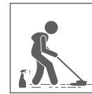
Spray and Mop